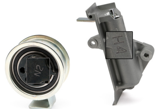
Photo 2: Tensioner pulley 531 0436 20 with vibration damper 533 0035 10